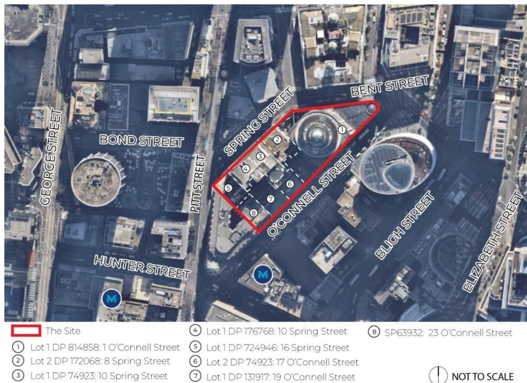
Figure 1 Site location

A single Design Competition is proposed to be undertaken and is intended to apply to the area of the site highlighted in Figure 1 , and is to be guided by the envelope illustrated at Figure 2 . The Design Competition will consider the context of the retained 1 O’Connell Street building, but will not apply to the tower of the 1 O’Connell Street building and portions of the existing podium.